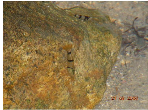
Shrimps in Stream D