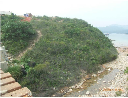
Buffer Zone of Stream A