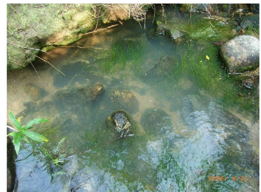
Stream C close-up