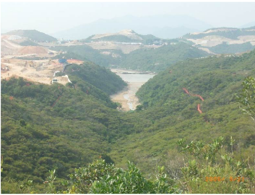
Stream B and the buffer zones