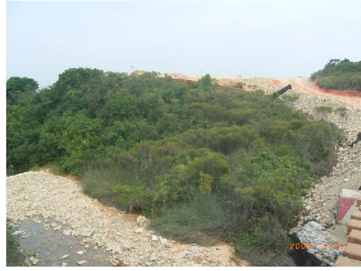
Buffer Zone of Stream A (2)